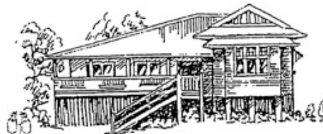
Noosa Arts & Crafts

We would be most grateful if members could spare some time and help with event. Please give Cathy your name if you are willing to participate.